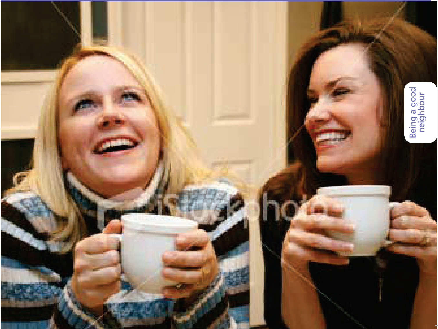
Being a good neighbour