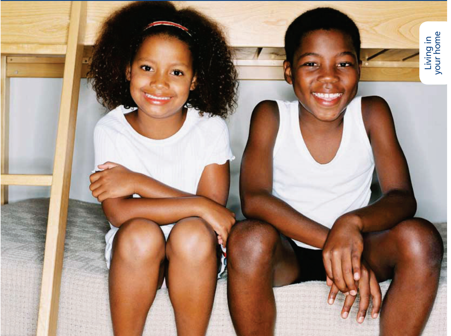
Living in your home